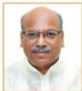
Sanjay Shamrao Dhotre Minister of State for Human Resource Development

India aspires to become a 5 trillion dollar economy in a near future. To reach this mark, it needs to evolve system and mechanisms to convert the present demographic dividend into high quality technical human resource, capable of doing cutting edge research and innovation, and deep-tech entrepreneurship. At this juncture, the MHRD's Innovation Cell and AICTE have brought out the 'National Innovation and Startup Policy 2019' for students and faculty.