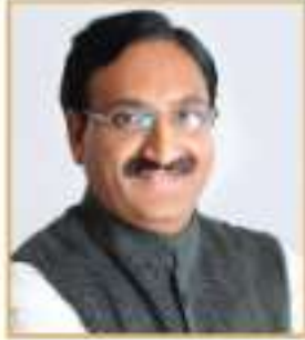
रमेश पोखरियाल निशंक मानव संसाधन विकास मंत्री

स्टार्ट-अप इंडिया भारत सरकार की एक प्रमुख पहल है, जो नवीन आविष्कारों को हाथ में लेने, सहायता और प्रोत्साहनों के वित्त पोषण, उद्योग-शैक्षणिक भागीदारी और इन्क्यूबेटर्स के बुनियादी स्तंभों पर आधारित है।