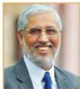
Anil D Sahasrabudhe Chairman, AICTE

I am very happy to see that the detailed guidelines have been issued by Ministry of Human Resource Development on National Innovation and Startup Policy for students and faculties of higher education institutions which further strengthens the Startup Policy released by All India Council of Technical Education in November 2016 from Rashtrapati Bhawan, just after few months of Startup action plan announced by the Government of India in January 2016.